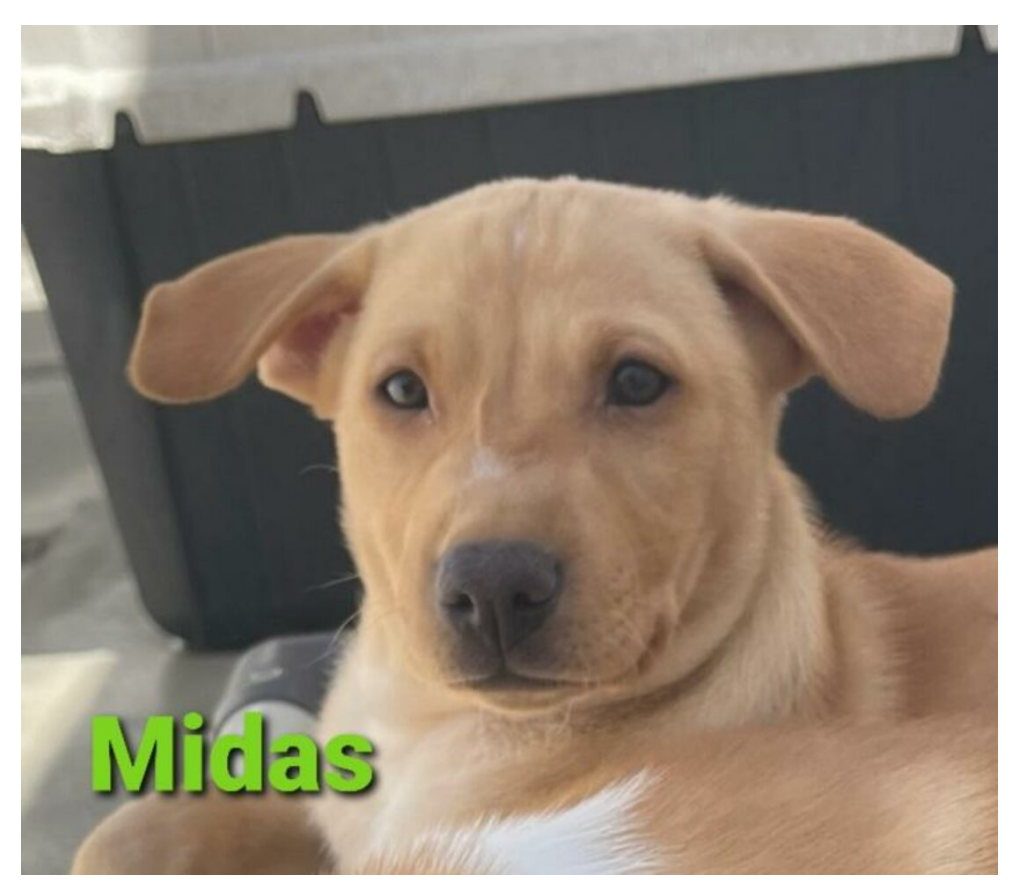
Midas is—well, a solid-gold survivor. He's one of the Fab Six, a bunch of little angels found in box at a tire shop near a busy freeway. Sparky took them all in, of course, along with another group of dogs, again of course. The poor things were malnourished, full of worms and covered in fleas. Today, thanks to the volunteers' "Midas touch," they are happy, healthy and ready for new homes.

Harry is such a good pup! He's 9 months old and full of joy and play. He was one of the "oops litters" that Sparky took in. His siblings all got adopted, but black dogs often disappear into the background and struggle to find families. But Harry is a diamond in the making—he loves people, dogs, playtime and life in general. Want to add some life to your life? You'll be wild about Harry!