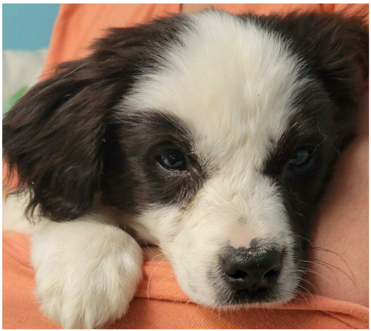
Levi is a spaniel mix about 3 months old—and about ready to go home with you.