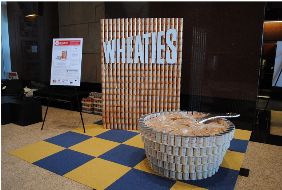
from CANstruction 2015.

The fourth annual CANstruction Long Beach event benefitting Food Finders food rescue/food bank has officially announced its call for local architectural, engineering, contractor and design firms to compete for best can-made structure.